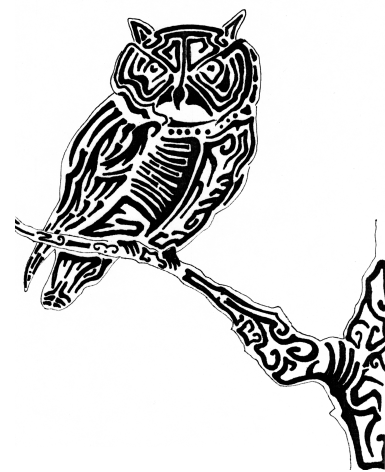
This is ‘QIQSOLAMIT KUHKUKHAHS, the Screech Owl. In Passamaquoddy legend it comes to warn that danger is nearby. This is such a time.

This flyer is being distributed to the Passamaquoddy community, national media, worldwide indigenous and environmental rights organizations, and other Native communities, and can be downloaded from our website.