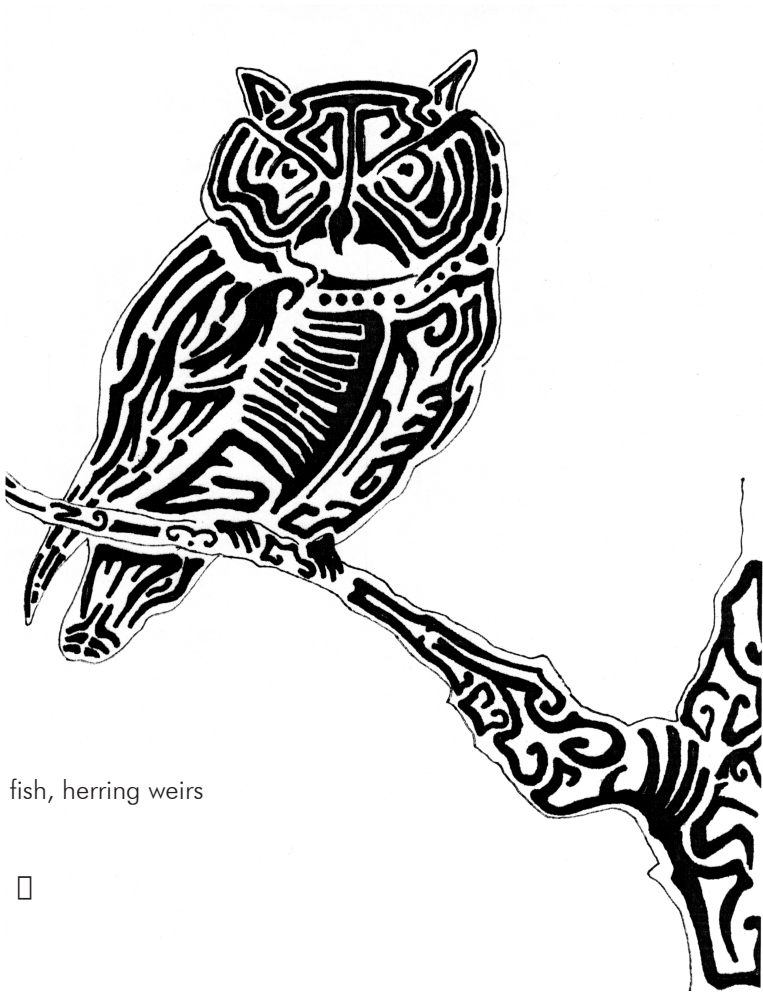
This is ‘QIQSOLAMIT KUHUKHAHS, the Screech Owl. In Passamaquoddy legend it comes to warn that danger is nearby. This is such a time.